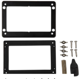
Accessories included with the GX Touch 50 / 70

Optional accessories for GX Touch 50 / 70 only