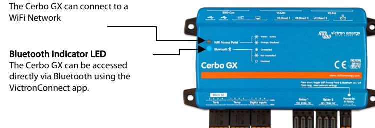
4 x resistive 4 x Temp 4 x Digital Relay 1 Relay 2 Power in Inputs inputs