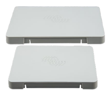
GX Touch 50 & 70 protective plastic cover (not for the Flush model)